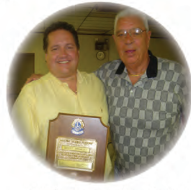
Melvin Jones Fellow Award Presented by Lions Club 2005