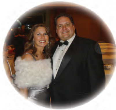
Alexandra House Hope Gala 2006