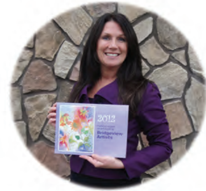
Lee Carlson Center for Mental Health and Well Being 2011