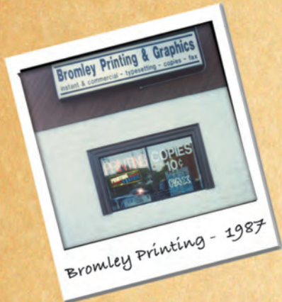
Bromley Printing - 1987