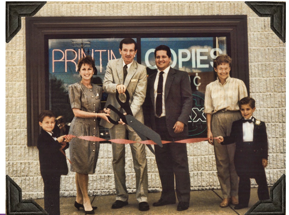
1988 RIBBON CUTTING AT BROMLEY PRINTING