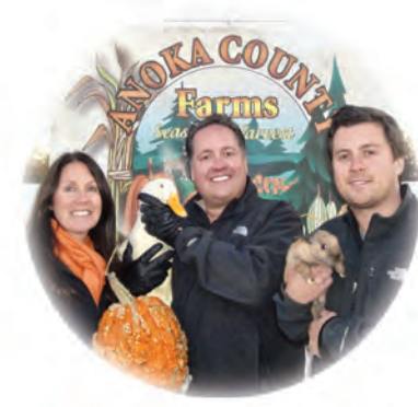
Sunrise Networking Breakfast at Anoka County Farms 2010